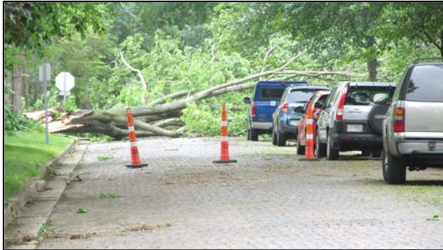
Fallen trees blocked streets at multiple locations, generally along the Walnut Street corridor.

Early in the evening of May 19, a cold front blew through Fairfield County from west to east. Bremen experienced a brief but intense burst of heavy driving rain and strong wind. Left behind, were several downed and badly damaged trees. Even the roof of a baseball dugout at the park was blown off. Fortunately, there were no reported injuries or electrical outages.