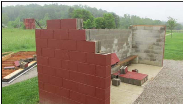
The roof was blown off a baseball dugout at Howell Park.

Cleanup started in earnest the next morning, with village crews focusing on clearing debris from streets and sidewalks. All the village employees, plus several volunteers participated in the effort and had the streets open after about 8 hours of work.