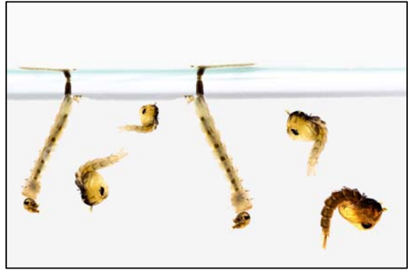
If you look closely into standing water and see tiny wiggling mosquito larvae like these, then there's probably an abundant mosquito population in the vicinity.

If you have these conditions on your property, then you are likely contributing to a mosquito problem for you and your neighbors.