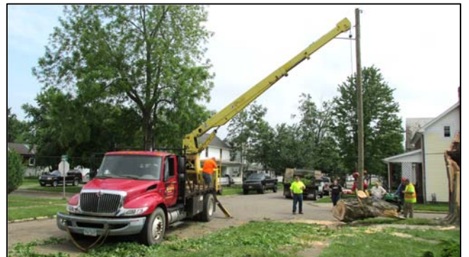
Moody's of Dayton, Inc., contributed their crane truck and an operator, to help remove large tree trunk sections.