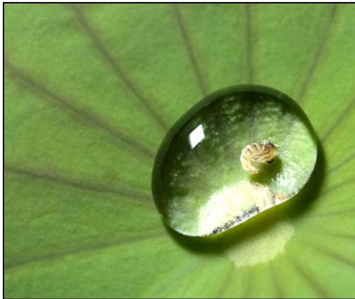
A mosquito larva can develop in a very small amount of stagnant water.

Instead, the absolute best strategy is for each property owner to eliminate the conditions on their property where mosquitoes can reproduce. That means eliminating stagnant water and damp conditions.