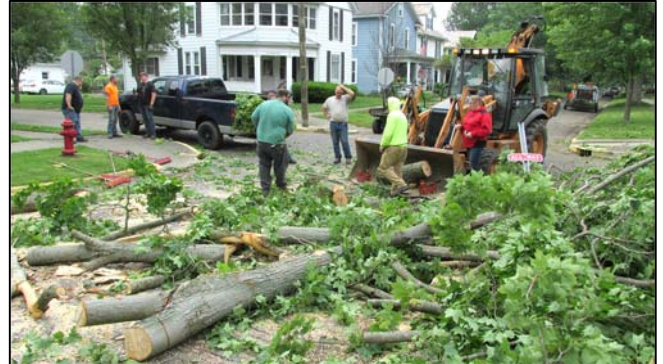
Several residents came out to assist village employees with clearing the streets.