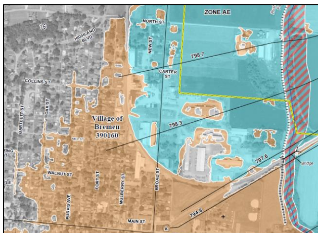
Portion of the proposed revised Flood Insurance Rate Map showing part of the Village of Bremen. Blue-shaded areas denote the 100-year flood hazard zone where property owners would be required to purchase flood insurance. (Note: color shading is absent on the black-and-white newsletter version)

Questions or comments about the proposed map revisions may be directed to James Mako of the Fairfield County Regional Planning Commission, 210 East Main Street, Room 302, Lancaster 43130. Phone: 740-652-7110.