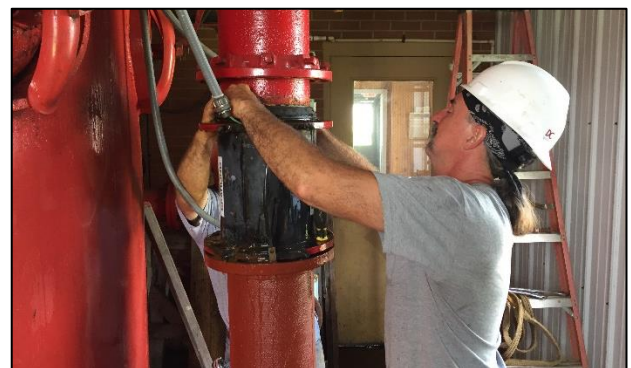
Doll-Layman, Ltd. is the project contractor. Doll-Layman workers are shown here making improvements to water lines inside the plant.

In advance, thank you for your patience during this important project.